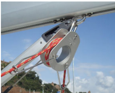
Walder positioning example

1 : Remove any existing boomvang tackle from under the boom. (In the case of a rigid boomvang, rig your WALDER boombrake aft of that rigid vang.) Rig your WALDER boombrake under the boom using a shackle, positioned approximately one-third of the way aft of the mast.