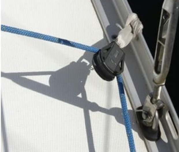
Example of block fixation

4 : On the other side of your boat lead the line through a block fixed at the external chainplate, pad-eye, or at the toe rail, at the same level as on the first side.