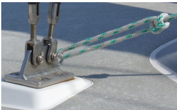
pre-stretched line attachment example

2 : Secure one end of pre-stretched line to a port or starboard external chainplate, pad-eye, or at the toe rail.