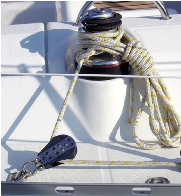
Cockpit fixation example

5 : Run the line back to the cockpit and secure it to a winch or a tackle.